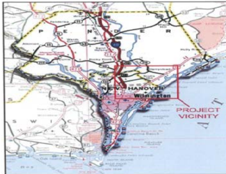
Figure 1 PROJECT VICINITY US 17 Corridor Study NCDOT TIP Nos. U-4751 and R-3300 New Hanover and Pender Counties