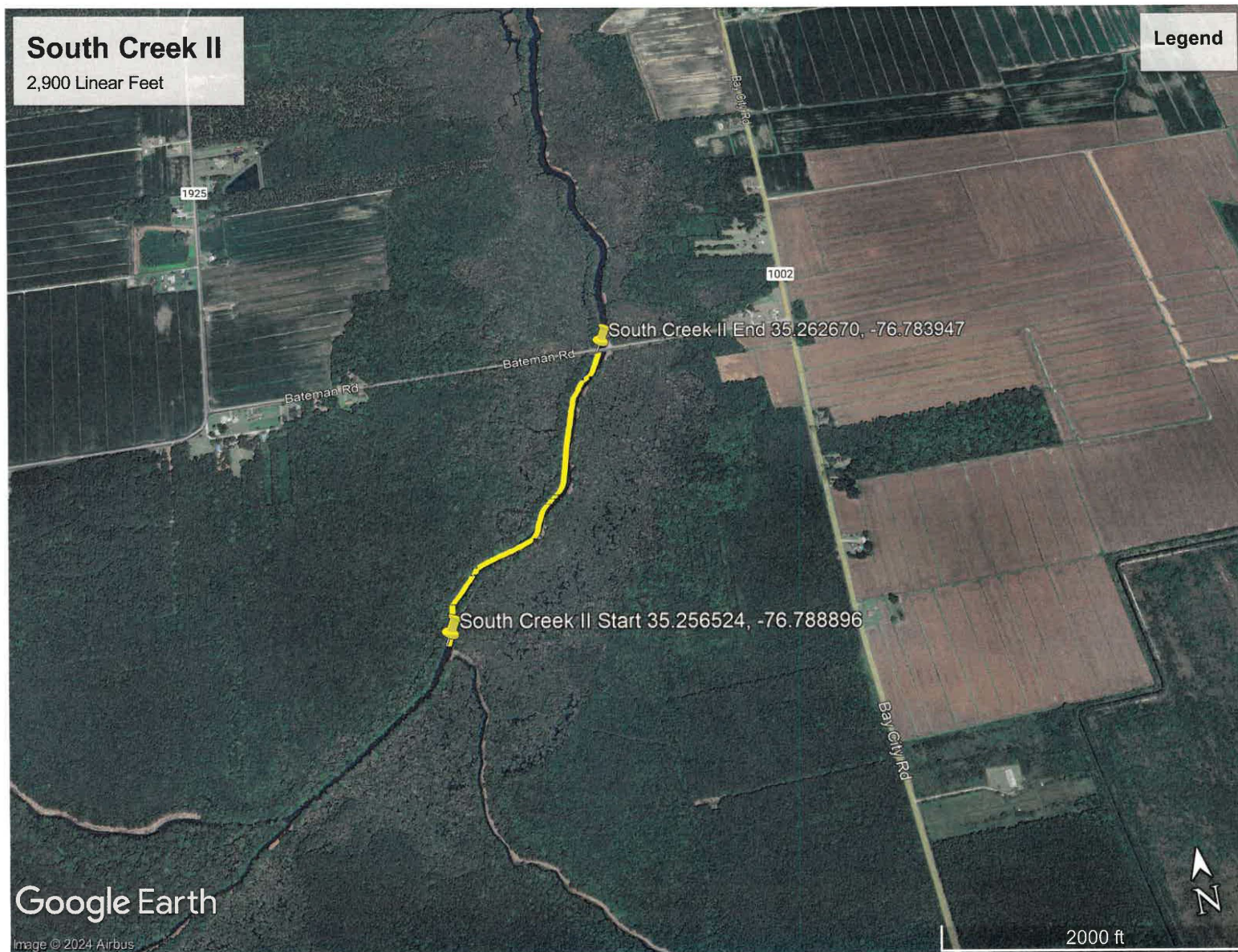
Figure 2: Vicinity Map